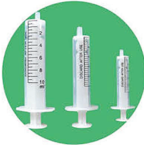
2-parts disposable syringe